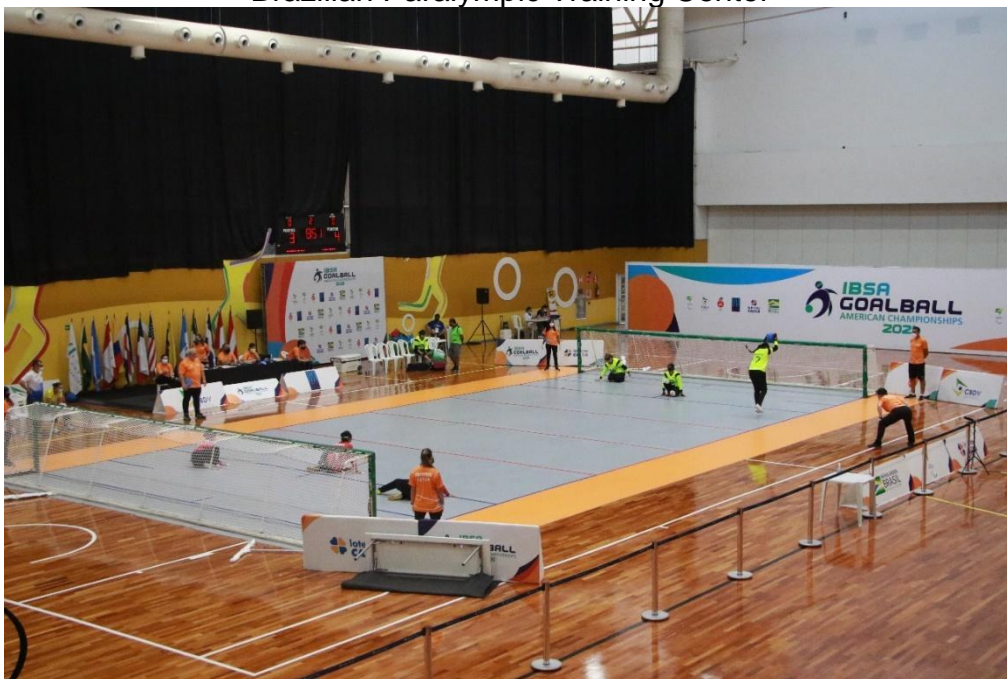
Brazilian Paralympic Training Center